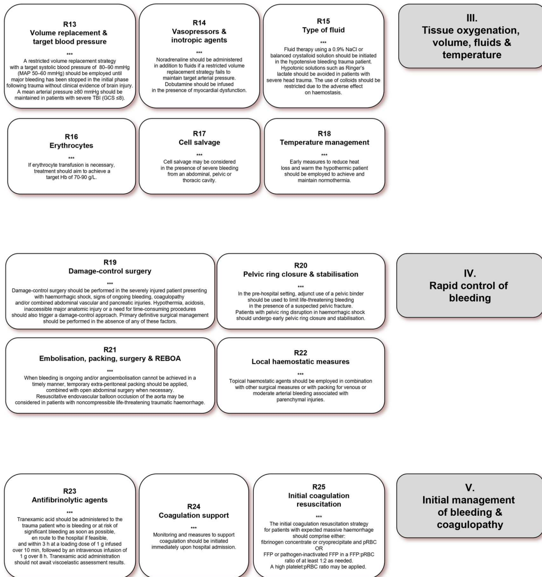
Fig. 1 continued